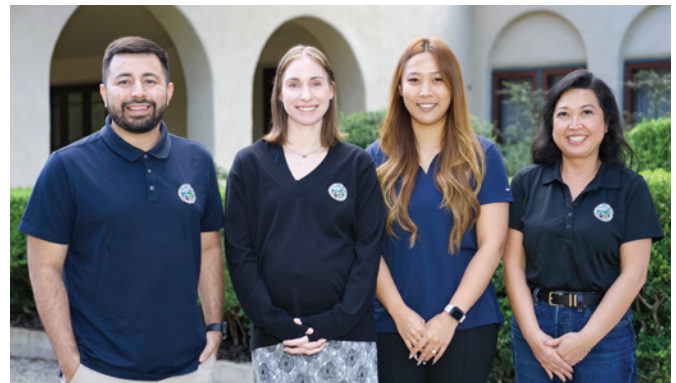
Ojai's Finance Department

Together, these actions reflect the City's commitment to responsible financial management, efficiency, and transparency for the Ojai community.